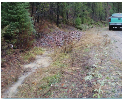
Figure 2. Roadside catchments capture sediment from runoff and allow water to infiltrate and sediment to settle out.

In 2004 MDEQ completed a Water Quality Plan and Total Maximum Daily Loads (TMDLs) for the Swan Lake Watershed. A key element of the plan is to reduce excess sediment delivery to streams from roads throughout the Swan Lake Watershed. PCTC installed BMPs on existing roads in the Goat and Piper Creek watersheds, including relief culverts and drivable drain dips that redirect sediment carried in snowmelt