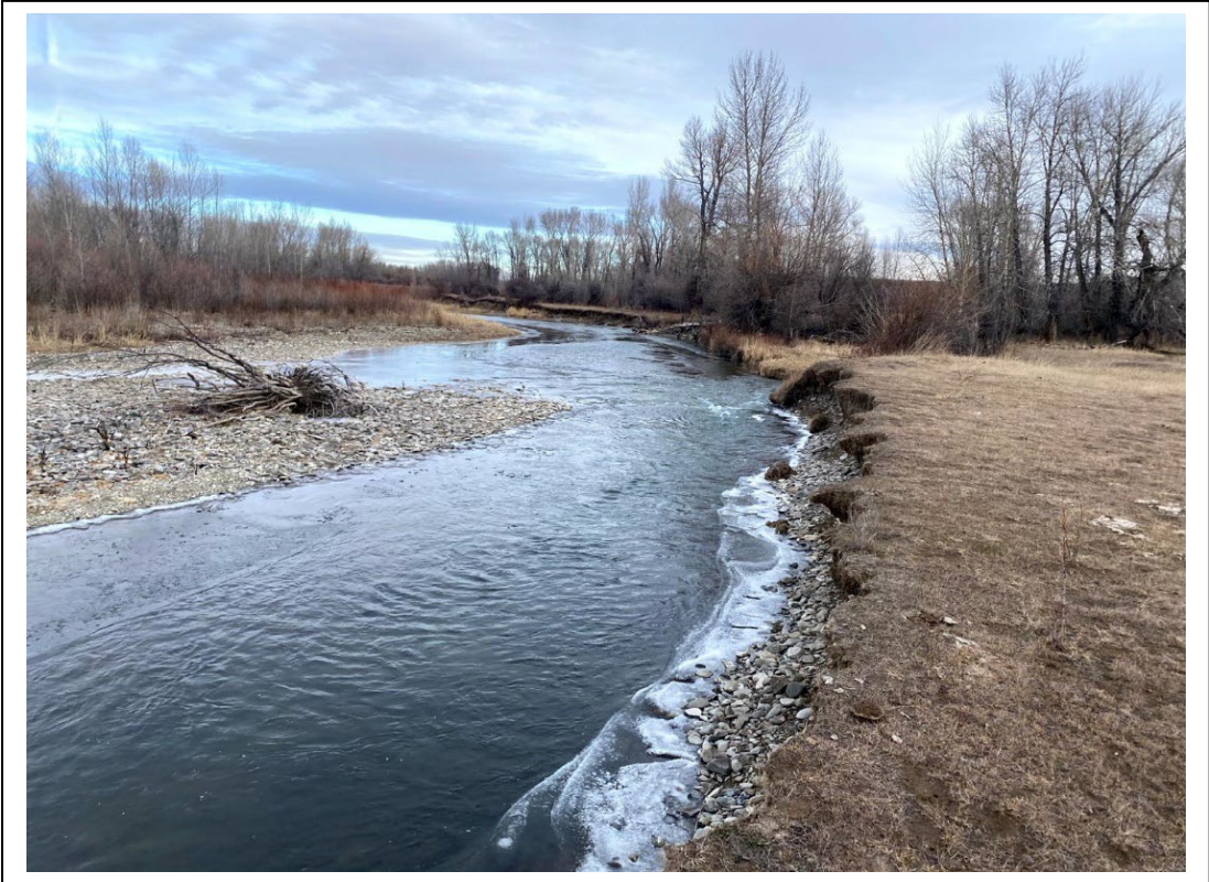
Figure 3 Looking upstream at eroding bank along Shields River (December 2025)