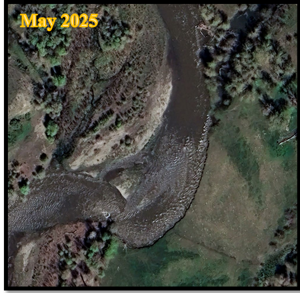
Figure 2 Aerial imagery comparison of project location from May 2017 versus May 2025, showing unnatural erosion rates due to altered riparian condition at the project site.