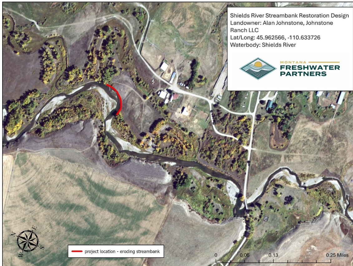
Figure 1 Location of the proposed project.