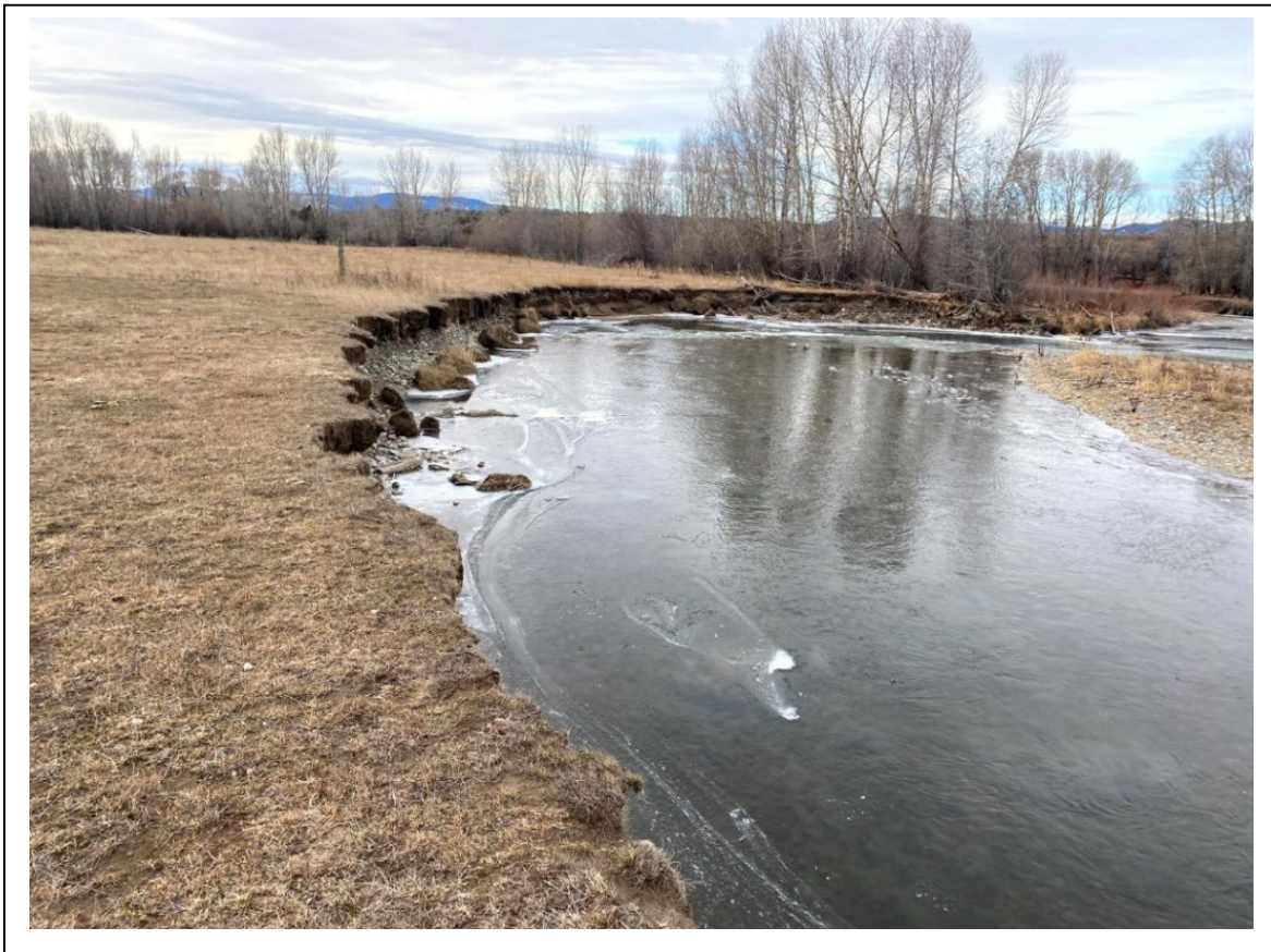
Figure 4 Looking downstream at eroding bank along Shields River (December 2025)