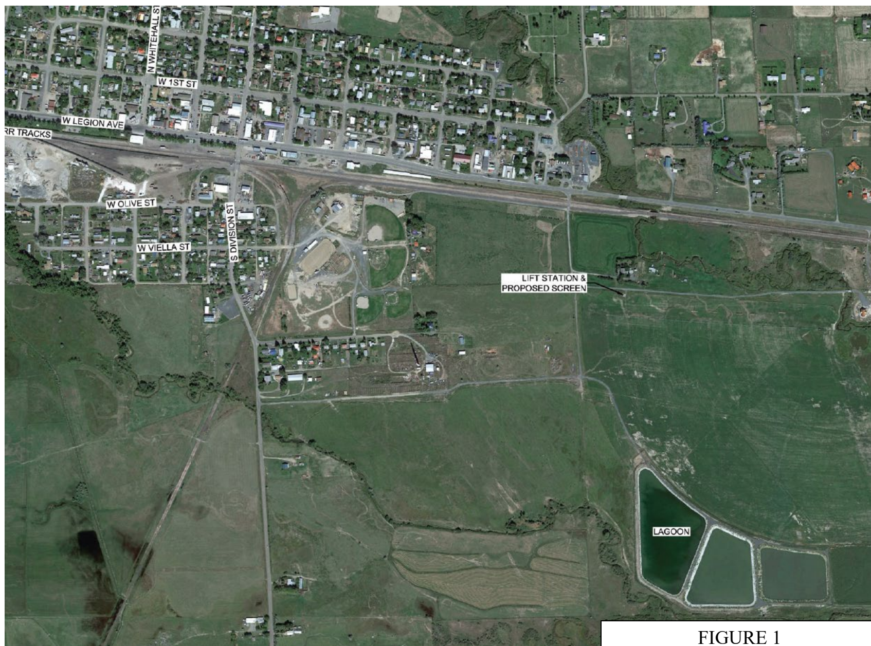
FIGURE 1 Town of Whitehall Lift Station Upgrade and Screen Installation Site