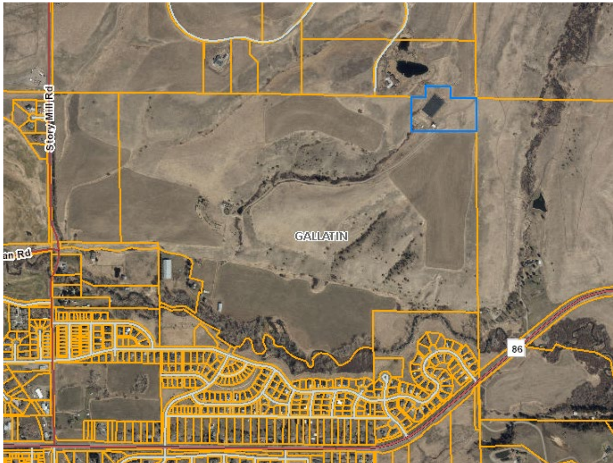
Figure 1: Map of general location of the proposed project

Located in the SESE of Section 29 and the NENE of Section 32, both of Township 01 South, Range 06 East, Gallatin County