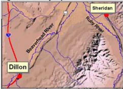
Figure 1A - Vicinity Map