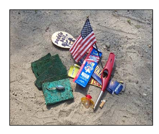
Discarded motor oil and oil filter (left) and discarded toys, lighters, etc. (right) Deerfield Agricultural Fair, New Hampshire