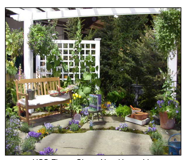
HCS Flower Show, New Hampshire