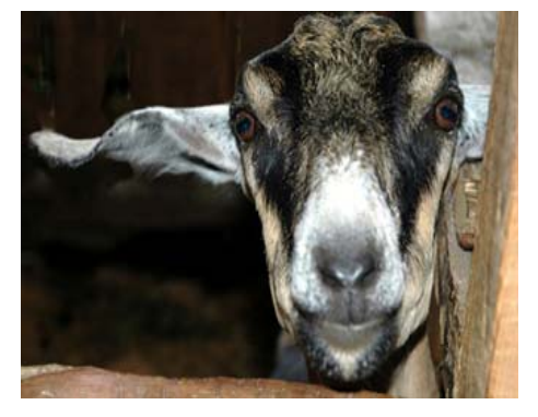
Tunbridge World's Fair, Vermont

Vegetative Waste - Flower shows and other events often have vegetative waste - flowers, greenery, trees - that can be composted or chipped for mulch.