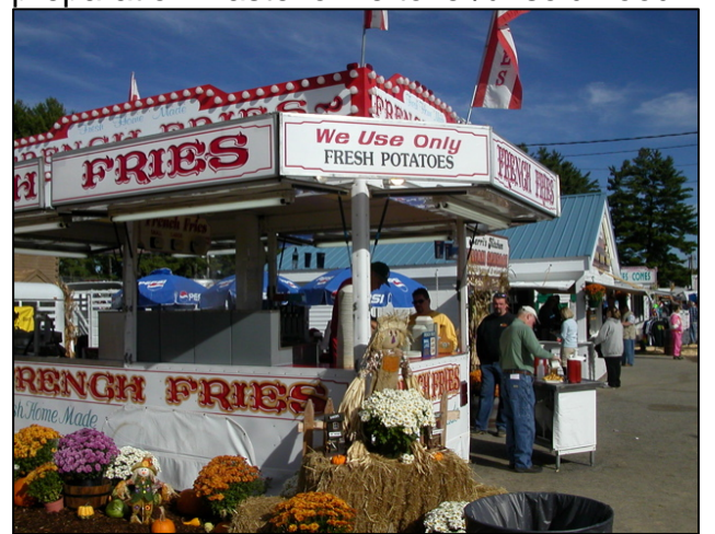
Deerfield Agricultural Fair, New Hampshire

Food Waste - Special events and food go hand-in-hand - fried dough, corn on the cob, hot dogs, and soft drinks, etc. And where there is food, there tends to be food waste. Food waste includes preparation-waste or leftover/unsold food from vendors, as well as plate scraps from attendees.