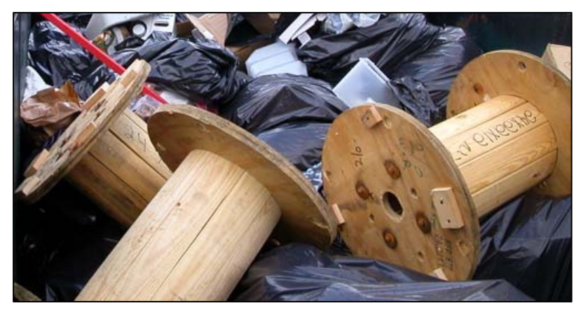
Discarded wood spools - Stowe Celebrates Summer, Vermont

Wood Waste - Wooden pallets, crates, and dimensional lumber used for displays and booths are commonly found in the waste at the end of events. These materials can be diverted for reuse or chipped for mulch, bio-mass fuel, or for composting.