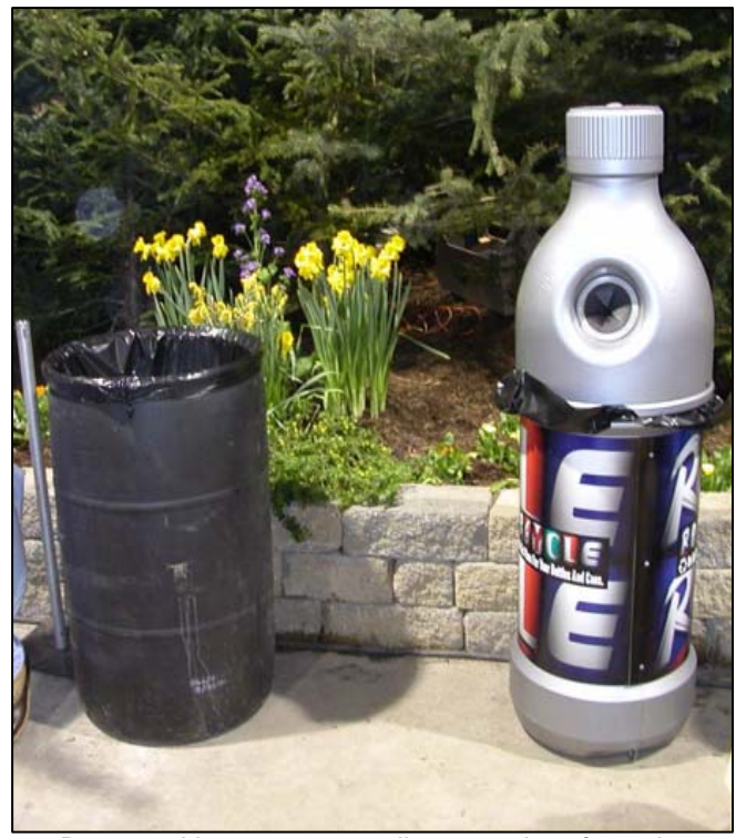
Borrowed beverage recycling container from the NH State Fair Association – HCS Flower Show, New Hampshire

Some state recycling programs or fair associations provide recycling containers to special events at no charge, except for the cost of transporting them to and from the event. Contact your state fair association member to inquire if containers are available.