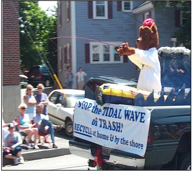
Rudy the Recycling Dog - Bath Heritage Days, Maine