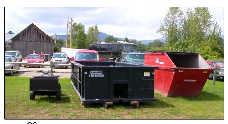
20 Impsters at Stowe Celebrates Summer, Vermont

Centralized containers are often used for garbage, and make sense for recyclable materials as well. These containers are not intended for use by the public, but are for staff, volunteers, and vendors. They may include dumpsters or containers for cardboard boxes, and centralized areas or containers for storing bags of recyclable cans and bottles, as well as wood waste. It is important to make sure