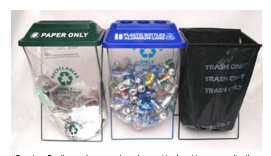
"Bag in a Box" recycling container donated by local beverage distributors at Bath Heritage Days, Maine