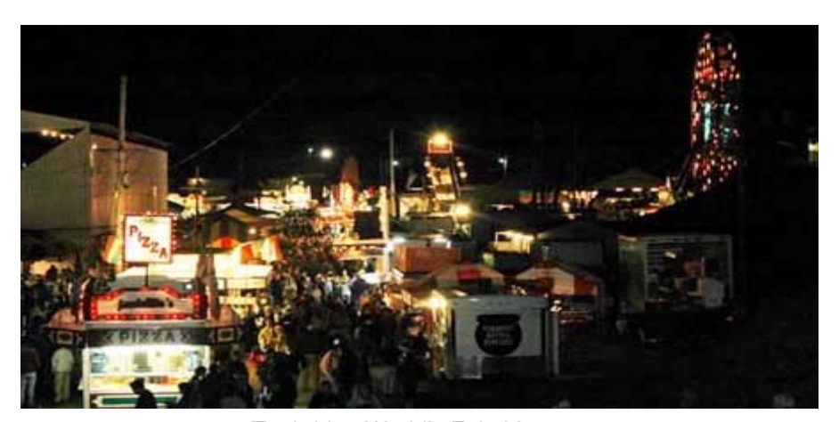
Tunbridge World's Fair, Vermont

Produced by the Northeast Recycling Council, Inc. © July 2006