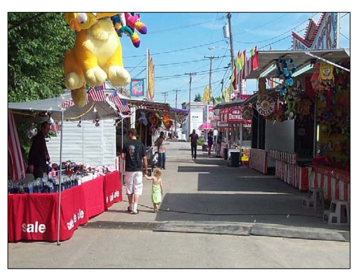
Bath Heritage Days, Maine