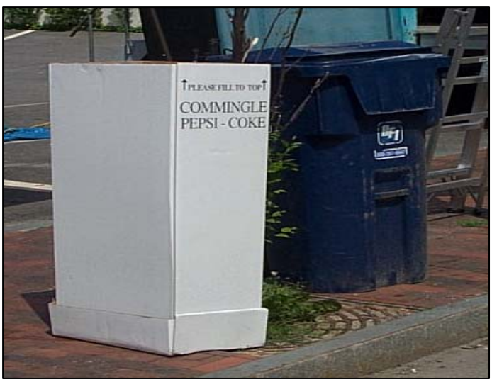
Recycling Containers used at Clinton Lions Club Agricultural Fair, Maine