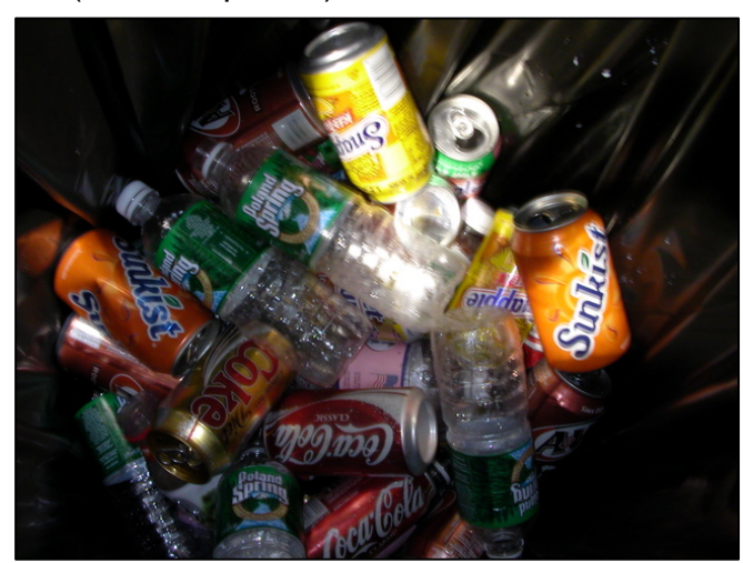
HCS Flower Show, New Hampshire

water, and beer are commonly found in special event waste. While some events prohibit beer, or only allow beverages to be sold as "fountain drinks" in paper or plastic cups, bottles and cans find their way into the waste stream. Many attendees bring these containers in backpacks; vendors keep their own supply to quench their thirst; and if camping is permitted at the event, bottles and cans will inevitably be present in that waste too. Depending on local recycling programs or services offered by haulers, beverage containers may be able to be combined ("commingled"), or they may need to be segregated before they are sent to a recycling center or facility.