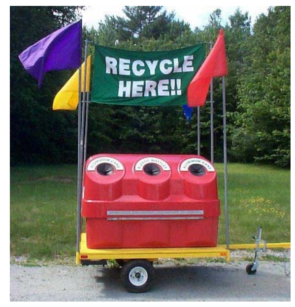
RecycleMobile, Northeast Resource Recovery Association (NRRA) http://www.recyclewithus.org/recyclemobile.html

Some state recycling programs or fair associations provide recycling containers to special events at no charge, except for the cost of transporting them to and from the event. Contact your state fair association member to inquire if containers are available.