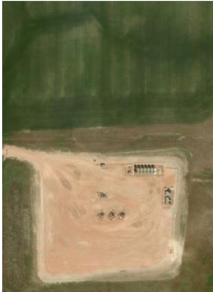
Figure 1: Map of general location of the proposed project.