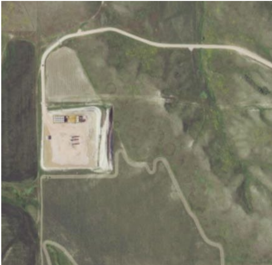
Figure 1: Map of general location of the proposed project.