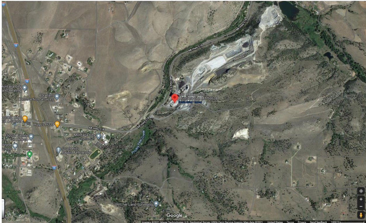
Figure 1: Map of general location of the Montana City Plant.