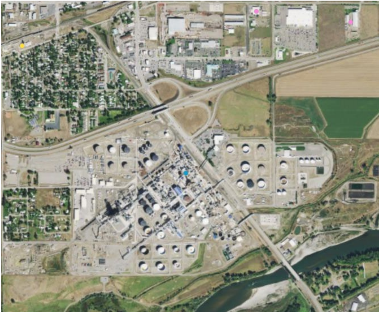
Figure 1: Map of the Laurel Refinery