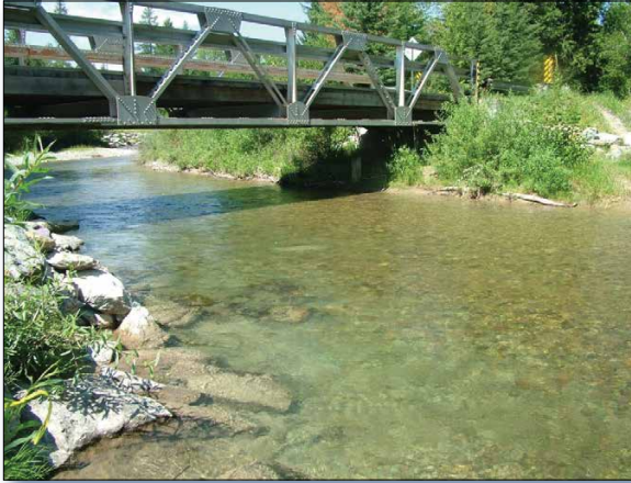
Figure 2. Projects partners installed bridges over Swift Creek to reduce sediment.

the state before conducting forest practices on private lands to ensure that BMPs are adopted to minimize nonpoint source pollution. The Streamside Management Zone (SMZ) Law (1991) regulates forest practices along streams to protect and maintain the SMZ (i.e., the riparian area), which serves as a natural filter of vegetation.