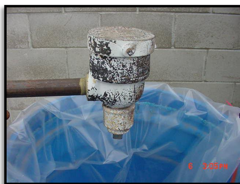
World War II-era mercury-containing gas pressure regulator.

Recommended Management: Mercury-containing gas pressure regulators should be removed only by qualified gas company personnel. Local government entities planning to demolish residential buildings (or anyone planning to demolish any building) having gas pressure regulators or other gas equipment should inform the local gas company of their proposed demolition