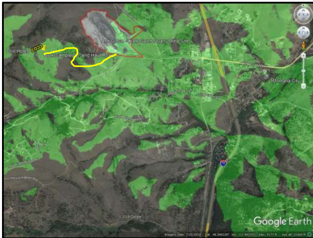
Figure 2: Viewshed Analysis (Google Earth, 2019). Pin represents highest topographic proposed disturbance, which represents the maximum extent of visibility. Green shading represents land that may view project site if a viewer is located at an observation point that is unobstructed by topography or forested vegetation

Based on the definition in ARM 17.4.603(18), secondary impacts are further impacts to the human environment that may be stimulated, or induced by, or otherwise result from a direct impact of the action. No secondary impacts to area aesthetics would be expected as a result of the proposed work.