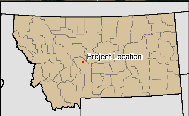
Figure 3.10-1 Black Butte Copper Project Baseline Soil Survey Map Meagher County, Montana