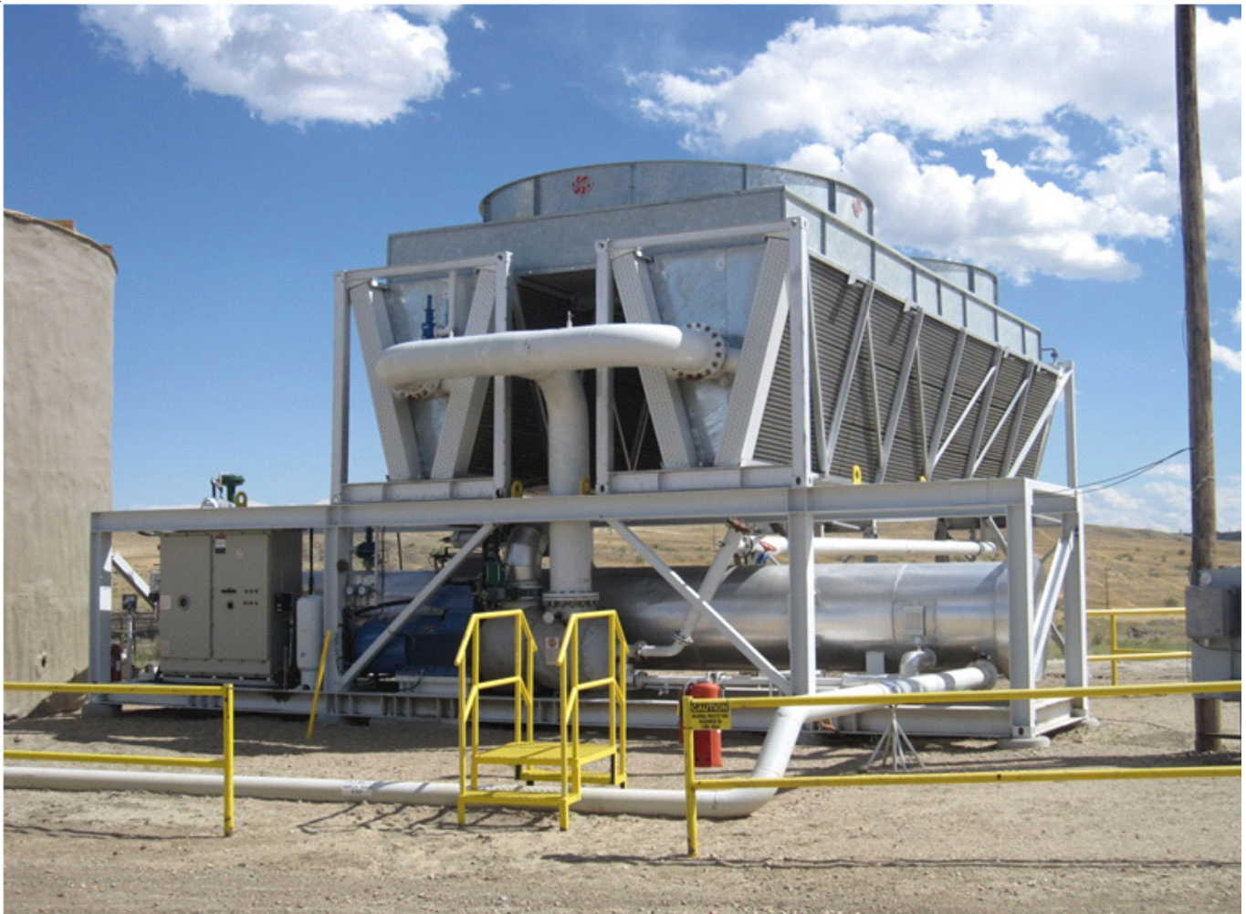
A binary generator at the Rocky Mountain Oilfield Testing facility near Casper, Wyoming. This power station uses 195 degree F water from an oil well to generate 250 kW of electricity.

Montana also is examining these promising new geothermal opportunities. In late 2011 the Flathead Electric Cooperative began drilling an exploration well near the town of Hot Springs, Montana in search of sufficiently hot water to use in a binary generator. And in 2012 a federally-funded feasibility study on using geothermal water from oil and gas wells is being conducted on the Fort Peck Assiniboine and Sioux Tribes Reservation in northeast Montana.