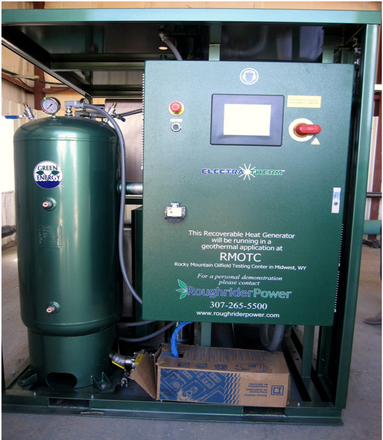
A small binary generator that will use geothermal fluids from an oil well is being evaluated at the Rocky Mountain Oilfield Testing Center near Casper, Wyoming.