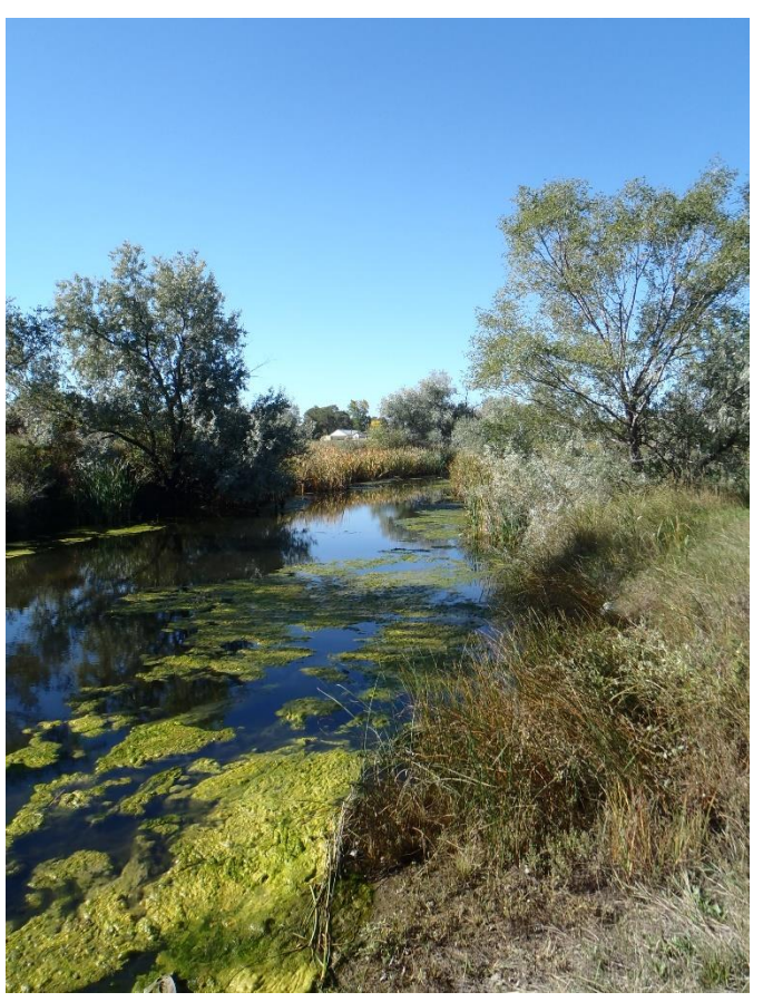
Tongue River Slough north of Miles City Railyard

liable parties and required them to remove all inactive USTs at the Facility. In 1995, four underground storage tanks along with a buried tank car used as an oil water separator were removed by DEQ as the liable parties failed to comply. In 2002, an aboveground storage tank used as part of the recovery system re-released approximately 37,000 gallons of diesel. A new extraction/recovery system was installed in 2004 to recover the re-released diesel. From 1995 through 2006, approximately 1,300 cubic yards of contaminated soil were removed, and approximately 500,000 gallons of diesel fuel were recovered, including the re-release.