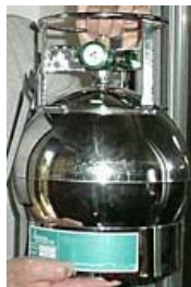
Summa canister for sampling indoor air

DEQ has required BNSF to sample indoor air and soil vapor in almost 200 homes and businesses between 2005 and 2009 to determine where vapors from contaminated soil and groundwater from the Facility might be entering buildings in and around the rail yard.