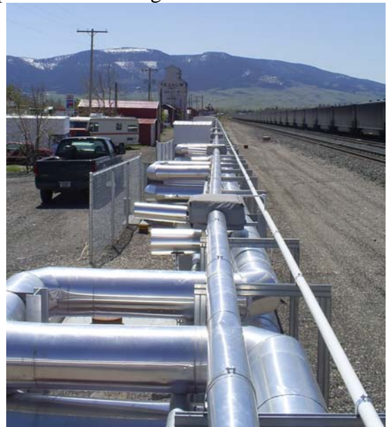
Mainline product recovery piping

ground. To date, DEQ estimates that the system has removed over 17,400 gallons of product from the ground.