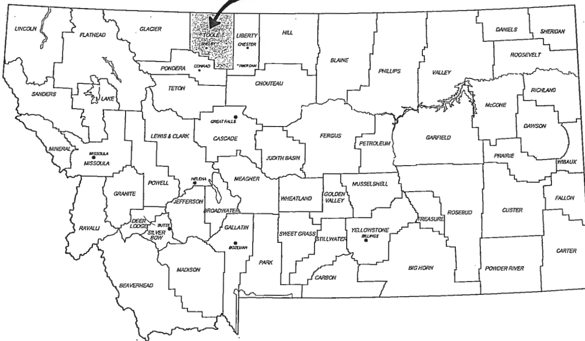
STATE OF MONTANA