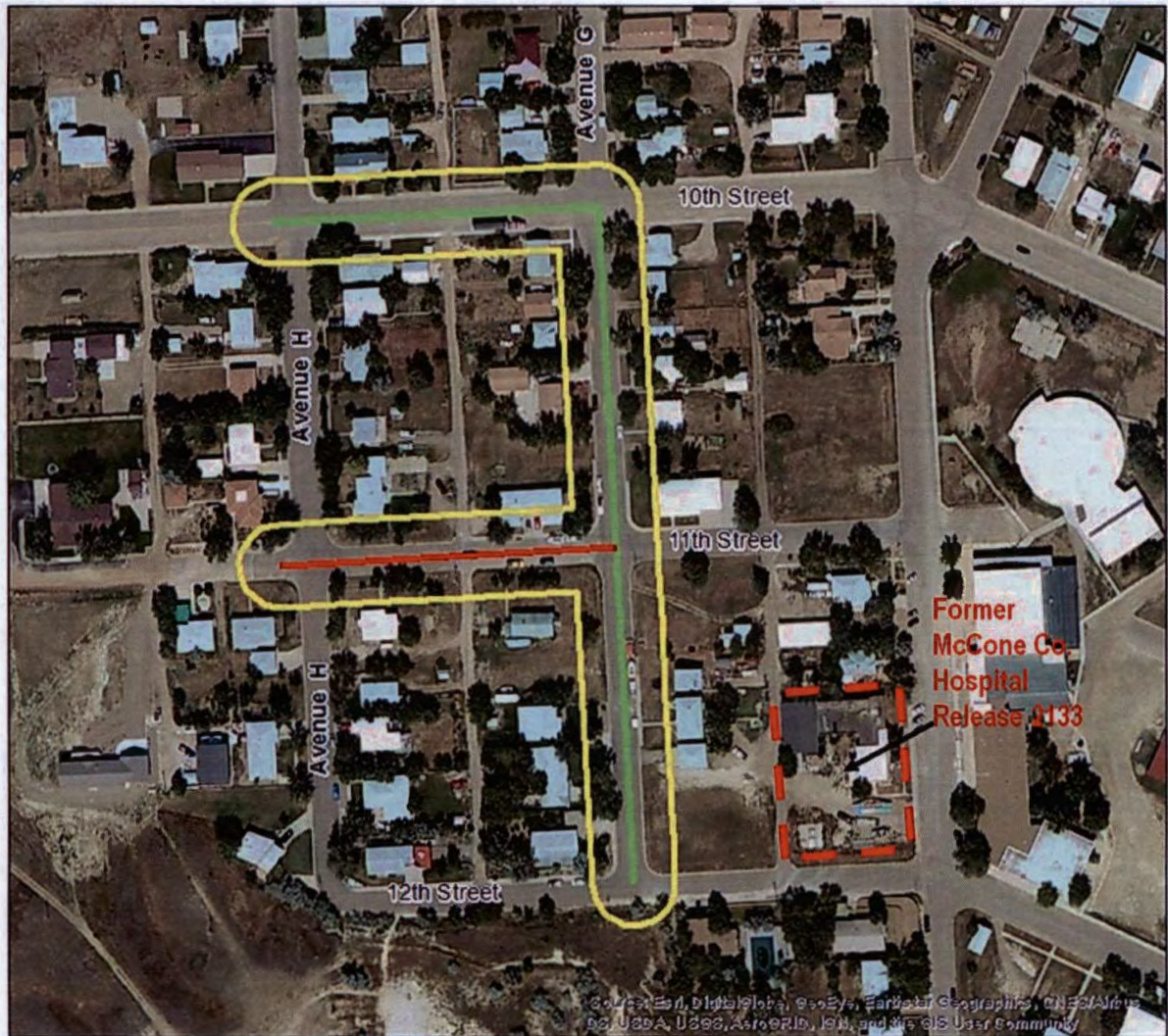
Figure 2. Eleventh Street Addition For Circle Water Main Project Potential Contaminant Source Review