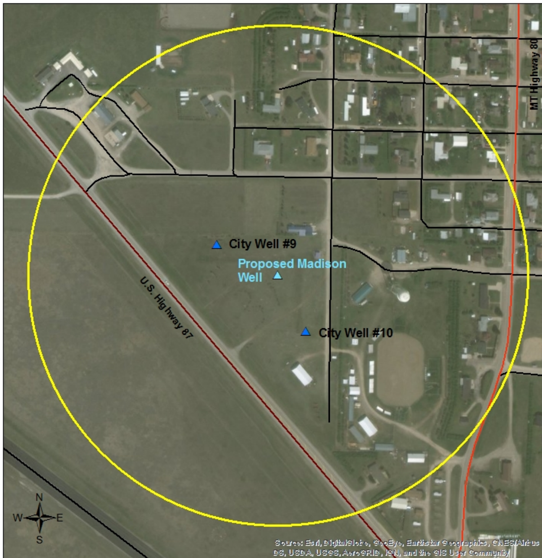
Figure 1. Stanford Proposed Madison Well Potential Contaminant Source Review