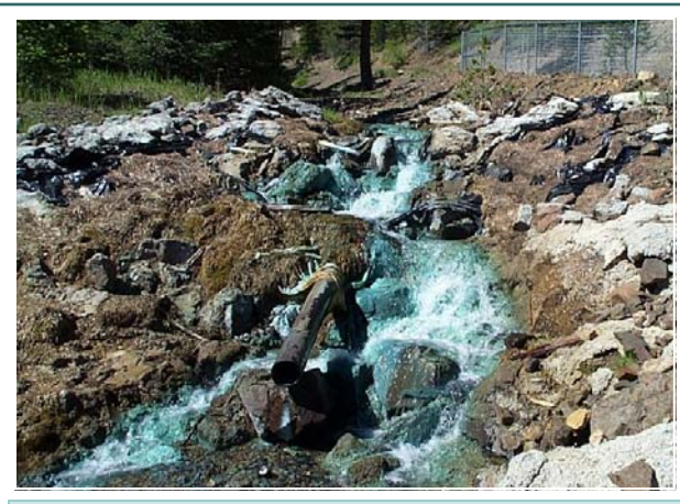
2007 photo of Mike Horse Creek rocks coated in metals precipitate. A groundwater capture system installed in late 2008 has reduced the metals in the creek.

Information Locations: USFS Office, Lincoln DEQ, Helena