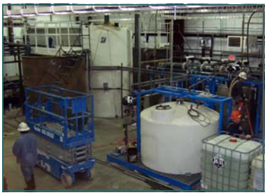
Water filtration system treats an average of 91,000 gallons a day.

of the soil and rock, and seismic potential to determine the suitability of a site.