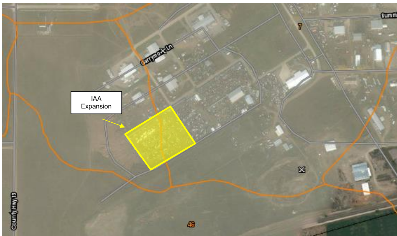
Figure 3.1 – Summary of Soil Properties Map