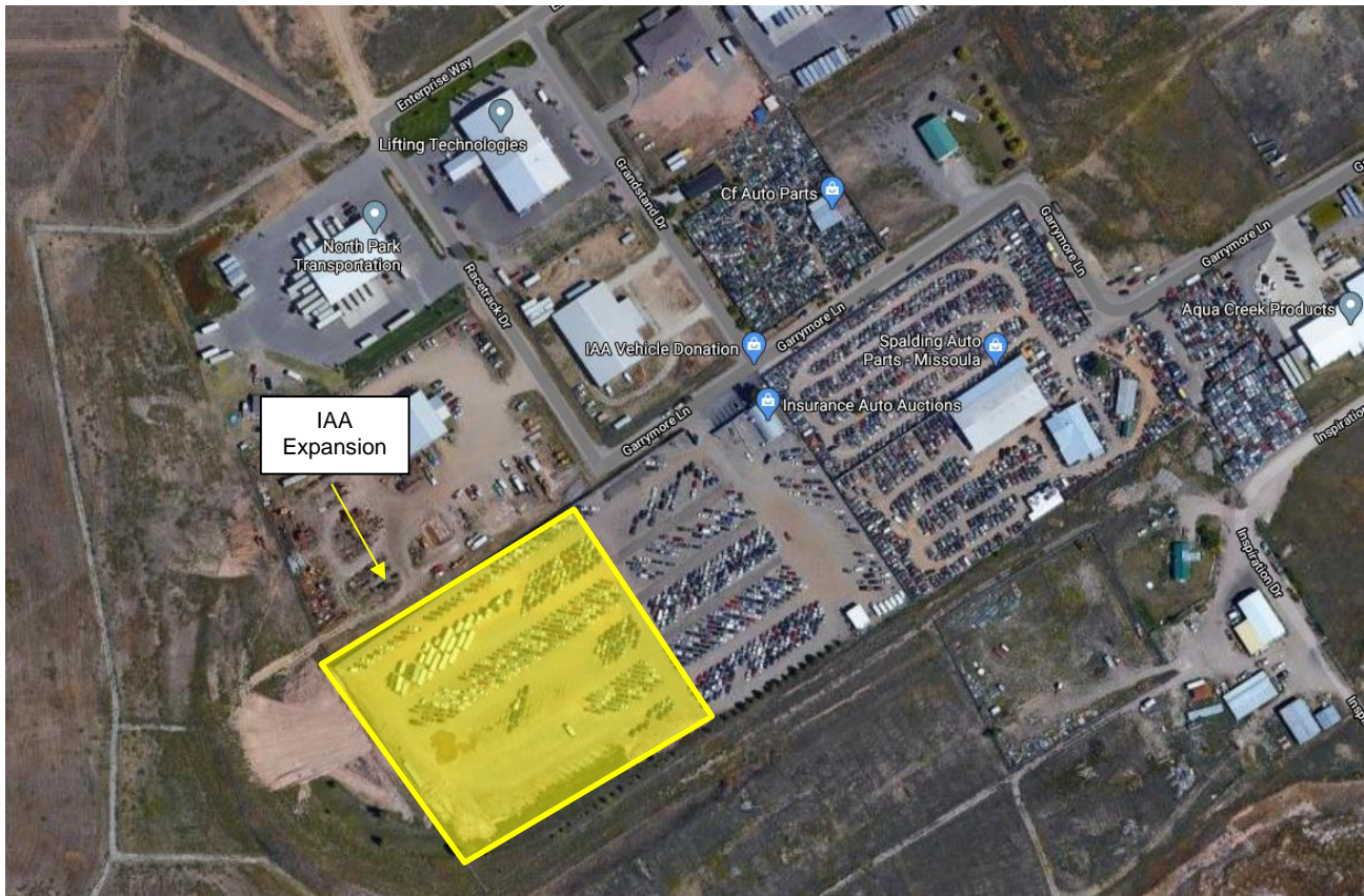
Figure 1.1 – Location of Proposed Site: Aerial View