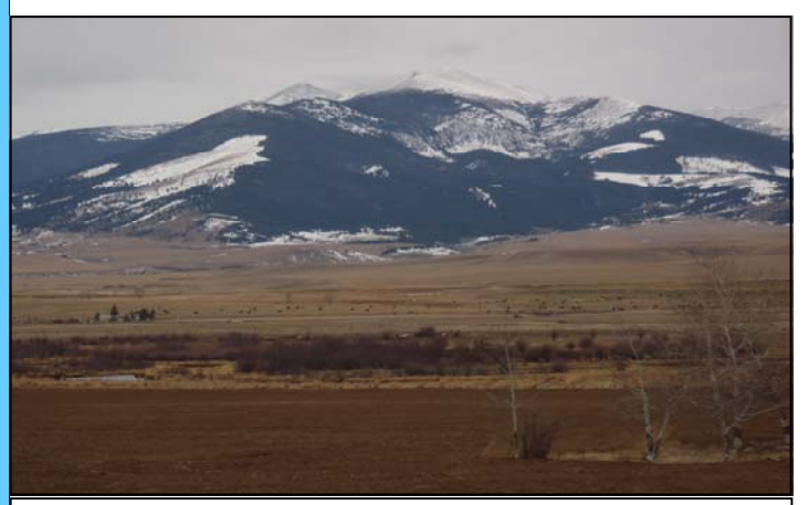
Post Pasture Remediation Work—November 2012