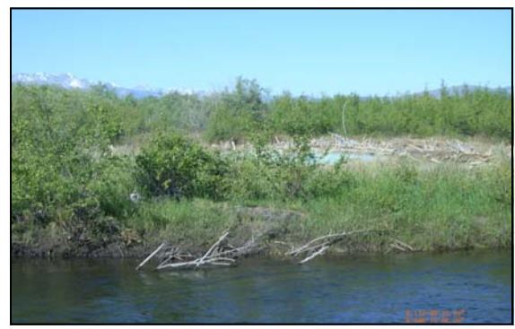
Slickens along the Clark Fork River, Reach A, Phase I.