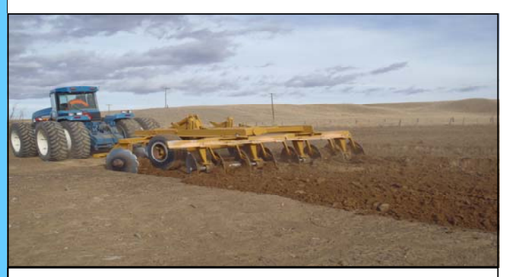
Beginning of Pasture Remediation Work-November 2012

The pasture lands were contaminated by historic flood irrigation from the Eastside ditch. These areas were sampled in spring 2010. Remediation will establish self-sustaining vegetation and reduce blowing dust.