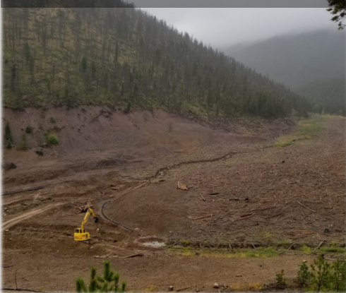
Rebuilding the stream at the confluence of Mike Horse and Beartrap Creeks.

Remediation work in Additive Alternates A and B will be completed in 2019 under the existing contract with Missouri River Contractors. Restoration of these areas will be completed under a separate contract, with work expected to begin in 2019.