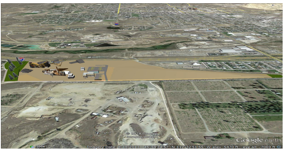
BSB rock crusher and asphalt facility, moved from its current location on Montana Street, and with reserved space on the east end of the Site for park/recreational use such as a Fire Training Center or Fair Grounds.