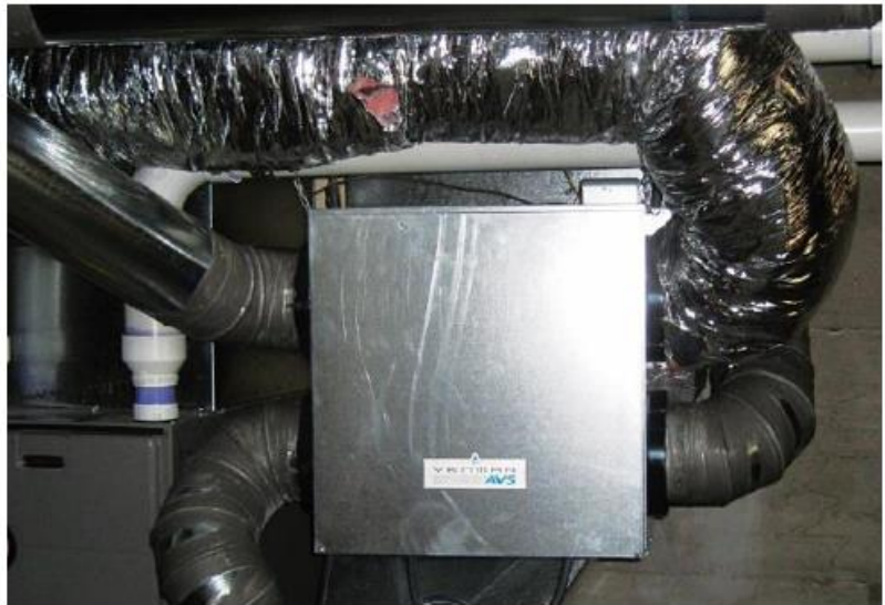
Heat Recovery Ventilator

For small energy-efficient homes, HRVs may not be cost-effective. If integrated with a central air handler, the potential for an HRV to provide cost-effective savings is reduced. An HRV collects air from spaces in the home that are most likely to produce moisture or pollutants and is then exhausted at a central point. Outside air is supplied by the central ventilation system to one or more spaces. When an air handler is present, the fresh air supply from the HRV can be connected to the return side of the air handler and the low-speed air handler fan is interconnected with the operation of the HRV. While it is possible to integrate an HRV with a central air handler, it is difficult to balance the HRV in this configuration because of the ducting and operating conditions of the central air-distribution system. For best results, most building science experts recommend that HRVs be independent systems. This approach it may result in higher initial costs.