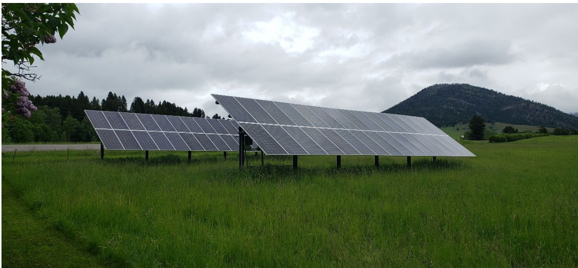
DEQ staff visit FY19-funded grid tied array completed outside Bozeman

Administrative costs for the AERLP include staff and program support salaries, promotional materials and ads, printing, travel, and contracted financial services. Contracted financial services include loan underwriting, origination, and servicing. Montana statute caps administrative costs of the program at 10 percent of the total loans (75-25-102 (3), MCA). DEQ policy EPP-AERLP-01-02 further elaborates that the administrative costs ratio be calculated based on the total loans outstanding at the beginning of the fiscal year. FY20 administrative costs totaled $325,929, equivalent to 7.23 percent of the total outstanding loan balance ($4,505,022), which is below the statutory 10 percent cap.